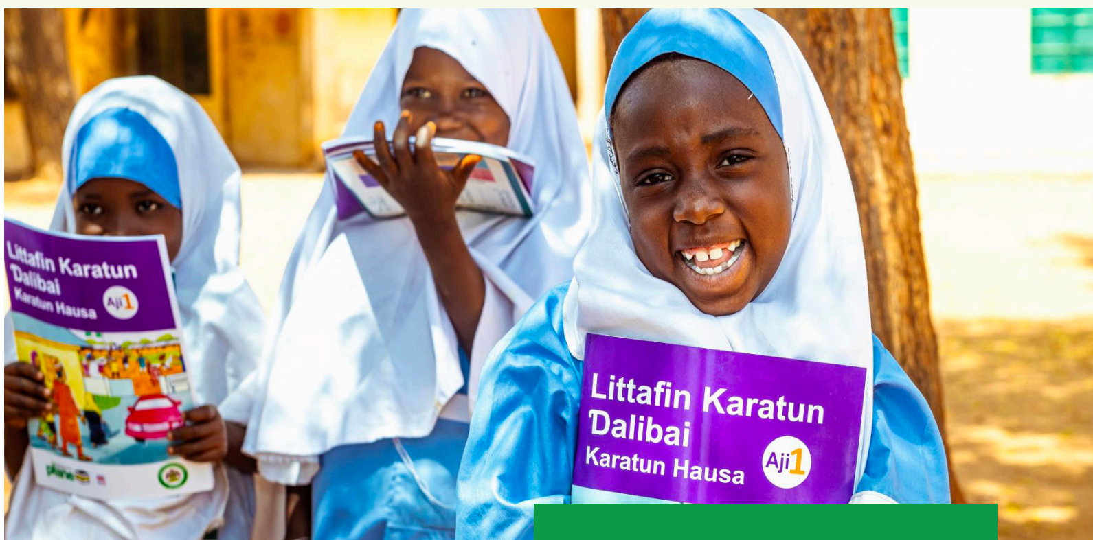
Learners from Wasai Special Primary School, Kano State, holding their PLANE books