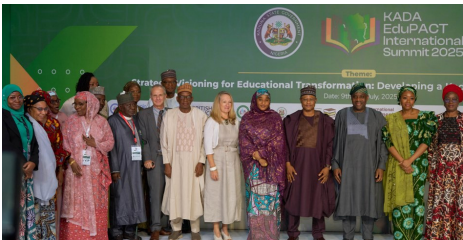
Special Guests at the KADA EduPACT Summit

At the KADA EduPACT Summit, the Governor of Kaduna State reaffirmed his administration's unwavering commitment to building a resilient, inclusive, and innovative education system that delivers measurable results for every child in Kaduna State.