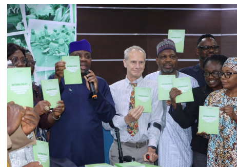
Participants holding copies of the newly launched policy