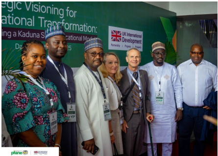
Guests from the British High Commission in Abuja at the KADA EduPACT Summit