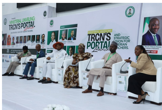
Panel session at the TRCN Portal Launch