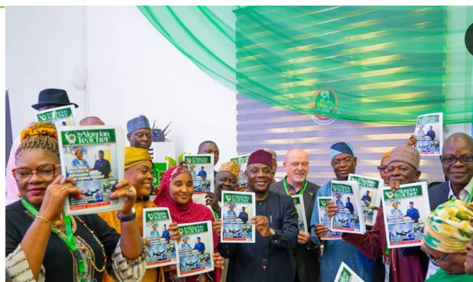
Official unveiling of the TRCN Portal's printed interface by the Minister of Education, Dr. Tunji Alausa

On Monday, 25th August 2025, the Federal Government of Nigeria, through the Teacher Registration Council of Nigeria (TRCN) in partnership with PLANE, launched the TRCN Digital Portal, a landmark initiative to modernise teacher management and strengthen professionalism in the education sector.