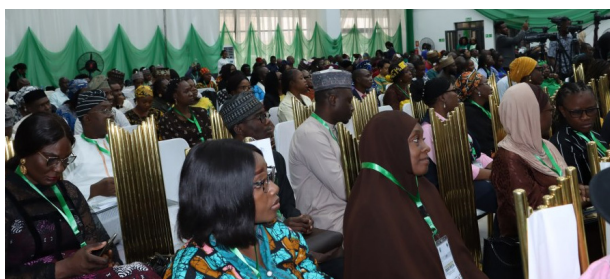
Cross-section of Participants at the TRCN Portal Launch