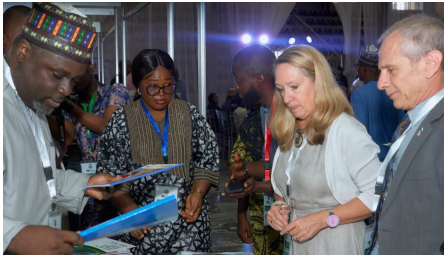
PLANE's Exhibition Booth