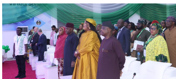
Cross-section of attendees at the TRCN Portal Launch

Click here to explore: TRCN - Teachers Registration Council of Nigeria | Teaching for Excellence