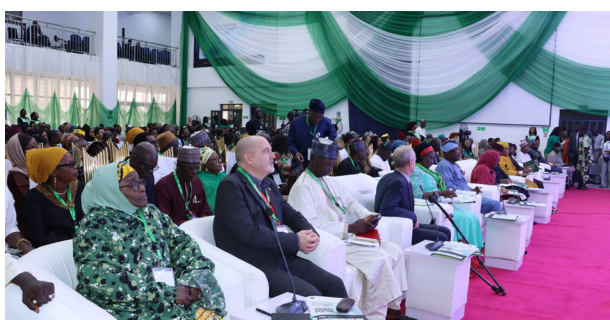
Cross-section of Participants at the TRCN Portal Launch