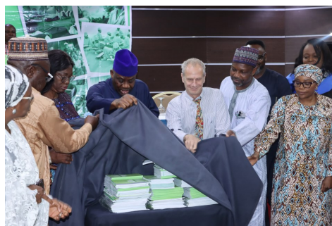
Unveiling of the National Policy on Non-State Schools in Nigeria by the Minister of Education, Dr Maruf Tunji Alausa