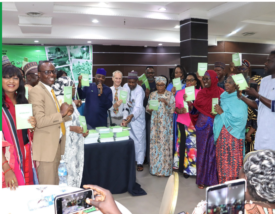
Unveiling of the National Policy on Non-State Schools in Nigeria by the Minister of Education, Dr Maruf Tunji Alausa

The Federal Ministry of Education, Nigeria, with support from the FCDO-PLANE programme, has officially launched the National Policy on Non-State Schools in Nigeria. This milestone represents a significant step forward in the collective effort to strengthen the management and regulation of non-state education providers — including private, faith-based, community, tutorial, charity, and other non-government schools across the country.